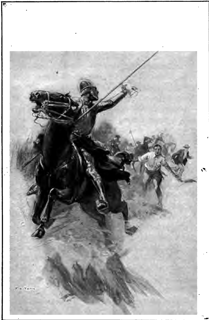
But every knight and every mounted policeman took out after the outlaw.